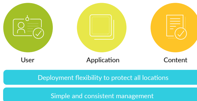
Figure 1: Core elements of network security

The following are the key capabilities of our Next-Generation Firewalls that safely enable your business.