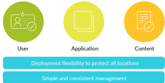
Figure 1: Core elements of network security

The following are the key capabilities of our Next-Generation Firewalls that safely enable your business.