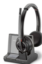
Savi 8200 Office UC Series