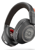
Voyager 8200 UC