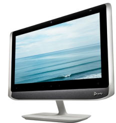
Poly Studio P21