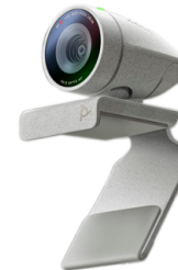
Poly Studio P5