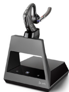
Voyager 5200 Office UC Series