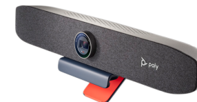
Poly Studio P15