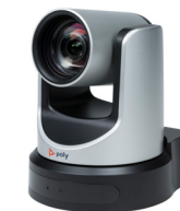
EagleEye IV USB