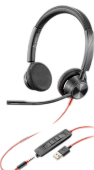
Blackwire 3300 Series (-M)