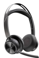
Voyager Focus 2

The Blackwire family gives you a broad selection of corded UC devices that deliver outstanding audio quality and reliability, ease of use and price points to meet any budget.