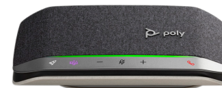
Poly Sync 20