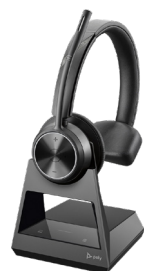
Savi 7300 Office Series