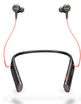
Voyager 6200 UC