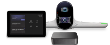
Poly Studio Large Room Kit