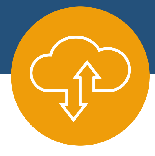
Are you having trouble protecting your clients' activities in the cloud?